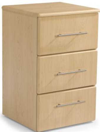
Huxley bedside cabinet [A7020-061]