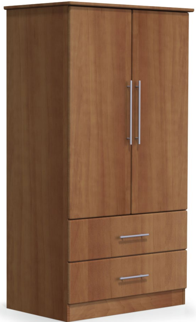
Huxley wardrobe [A7020-061W]