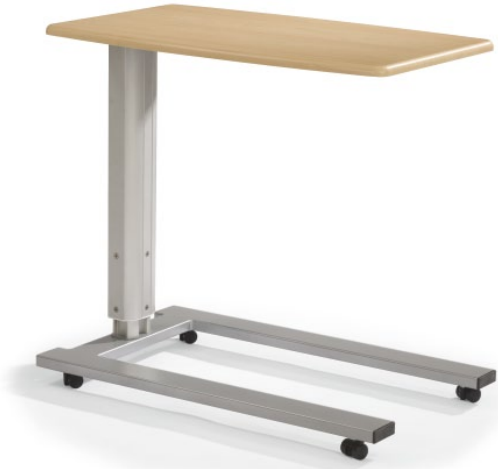
Weldon overbed table [A7000-AOBT]